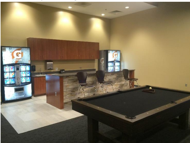
The players' lounge attached to the new locker room.

"Now we need to give back. We need to bring in more money, more fans. We need to bring back the tradition of winning."